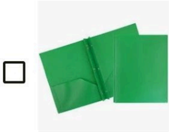
1 green plastic folder with pockets and prongs