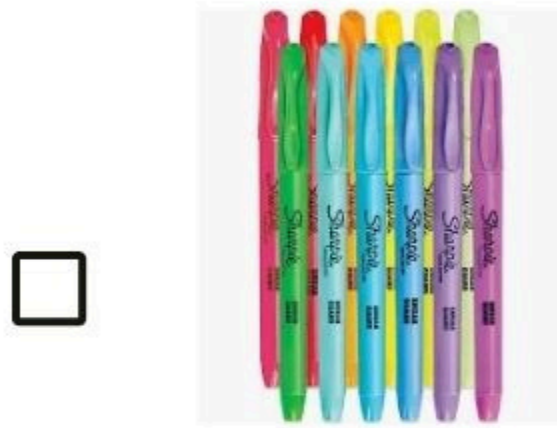
Multi colored highlighters