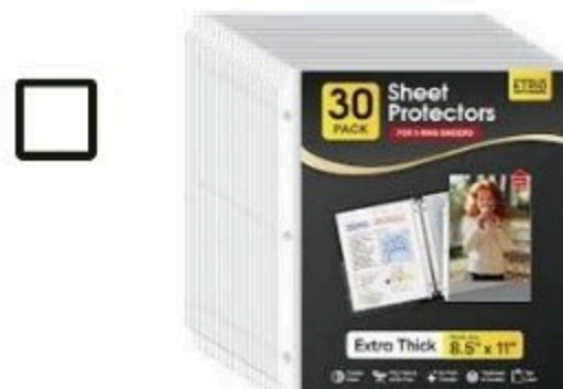
Heavy duty page protectors