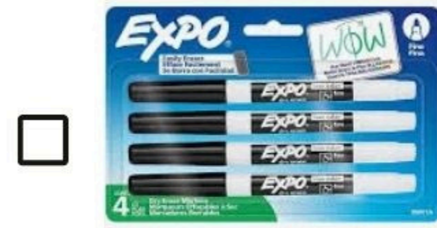
Fine tip dry erase markers