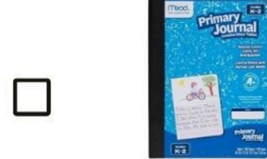
Primary journal composition notebook (drawing space at the top, handwriting lines)