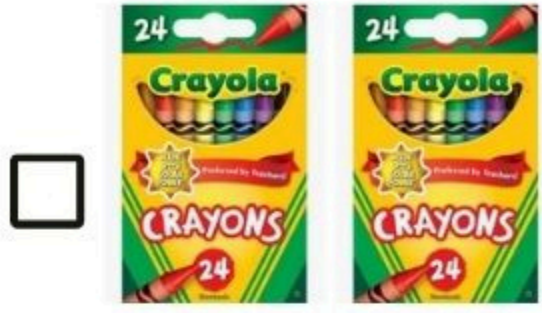
2 boxes of 24 crayons