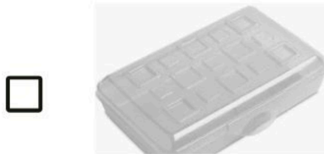
1 plain plastic pencil box