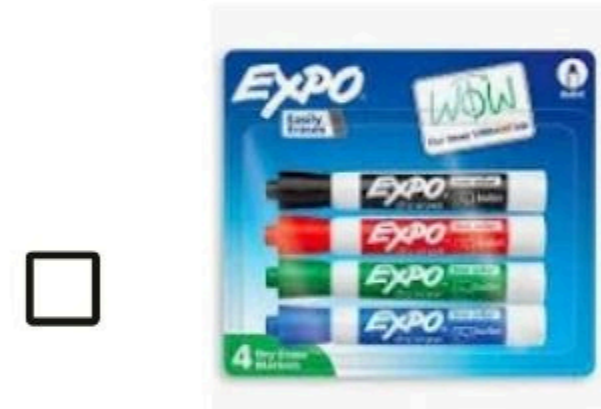
Chisel tip dry erase markers